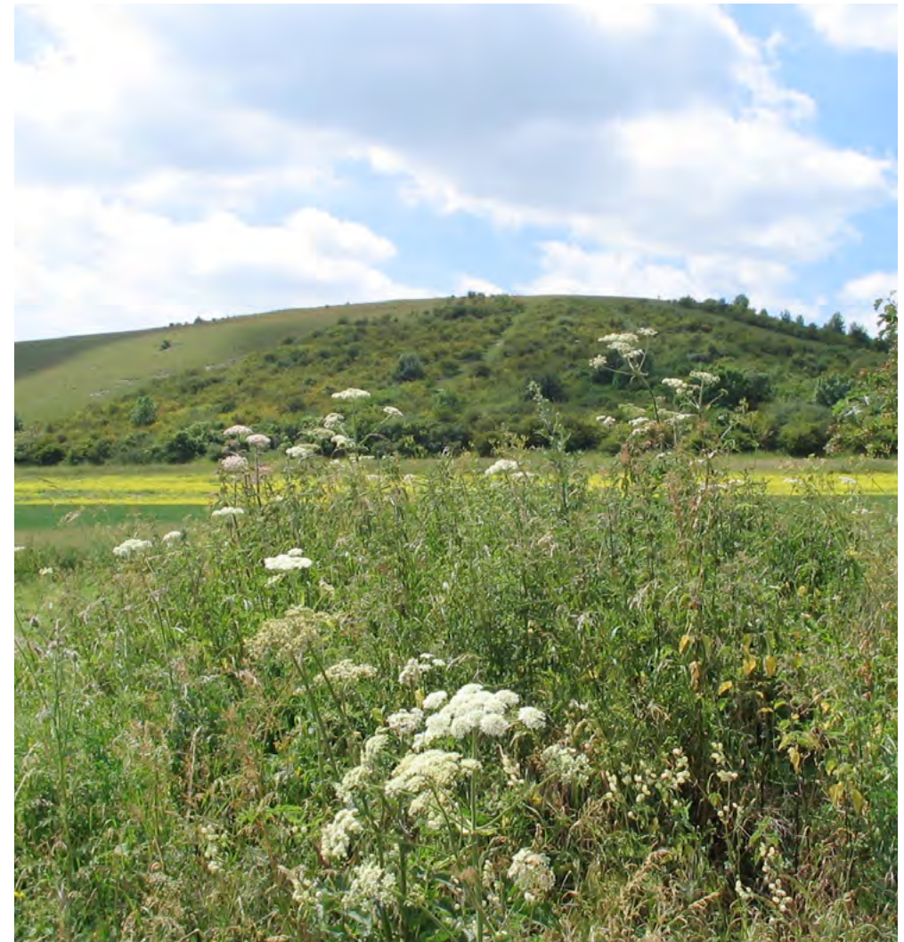
Burghclere Beacon. A hillfort on the northern scarp, popular for recreation, and managed for its chalk grassland habitat.

Cutting through this high, chalk landscape are the valleys of the rivers Itchen and Test. These are relatively narrow, with steep sides in places, and flat, lush valley bottoms of thick peaty and gravel deposits, through which flow fast, clear streams with a rich diversity of aquatic plants, insects and varieties of fish, including trout and salmon. At the head of the valleys and in small side valleys, flowing water can be seasonally intermittent, hence their name – 'winterbournes'. The main rivers, with fast-moving, well-oxygenated water, are largely fed by the chalk aquifer and much of the characteristic wildlife associated with these aquatic habitats is dependent on the quality and content of this water.