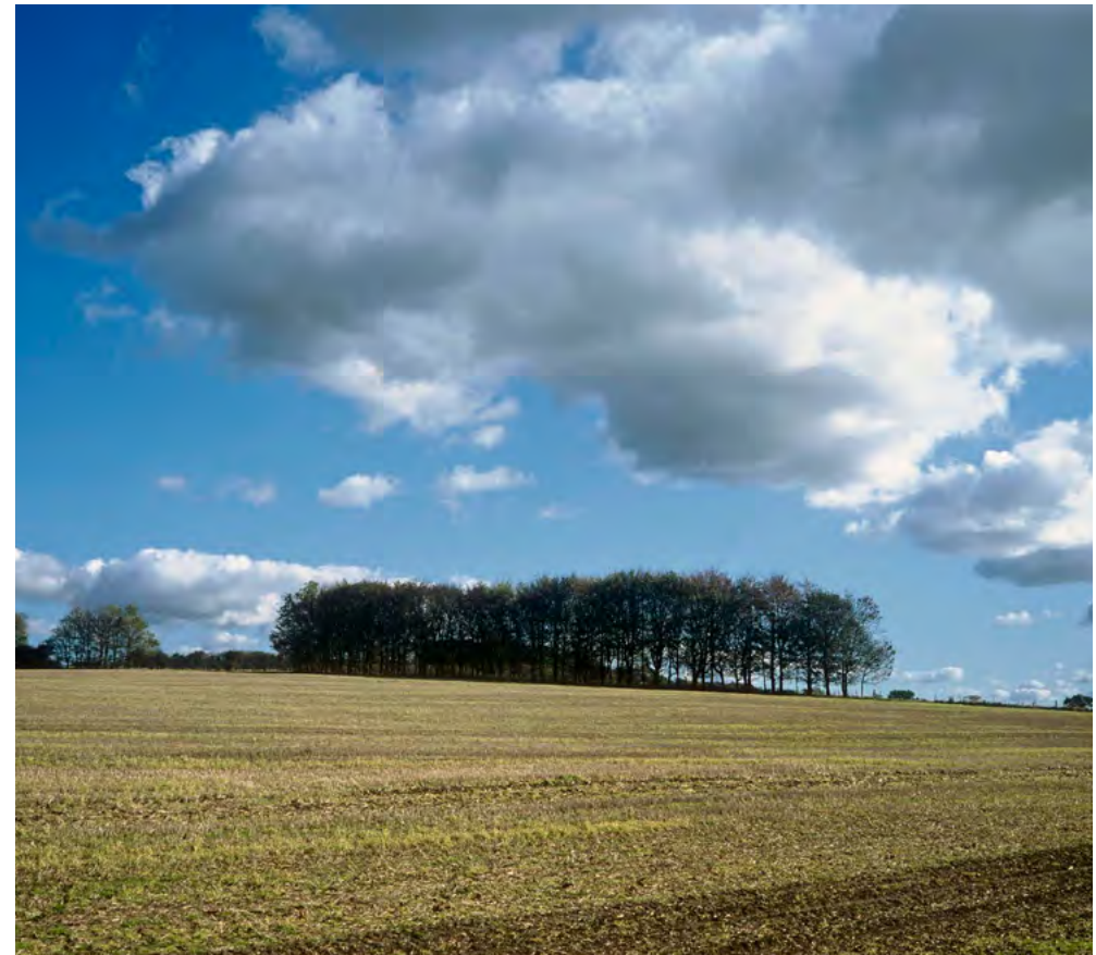
View across field stubble to copse.

Biodiversity and geodiversity are crucial in supporting the full range of ecosystem services provided by this landscape. Wildlife and geologically-rich landscapes are also of cultural value and are included in this section of the analysis. This analysis shows the projected impact of Statements of Environmental Opportunity on the value of nominated ecosystem services within this landscape.