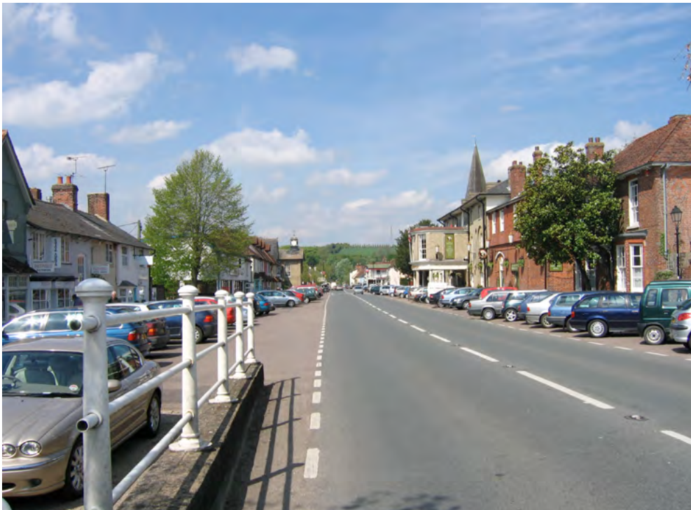
Stockbridge High Street crossing the River Test. A typical Hampshire Downs market town.

Andover (at the head of the Test catchment) and Basingstoke (at the head of the Loddon) are two market towns that were expanded to accommodate the London overspill population after the Second World War. Largely 20th-century, urban features demonstrating planned communities, they continue to experience rapid economic and housing growth. The river valleys provide the focus for smaller, nucleated settlements and market towns such as Alresford, Stockbridge, Whitchurch and Overton, and the communications that connect them.