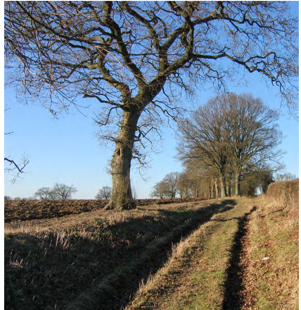
Trackways across the Downs connect ancient field systems and are popular with walkers, off road cyclists and horseriders.