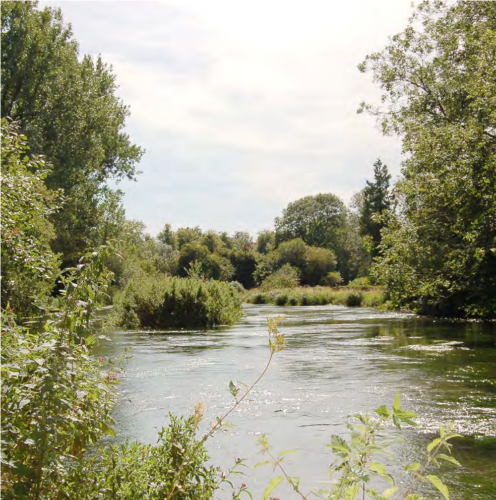
The River Itchen at Itchen Abbas, the home of fly fishing.