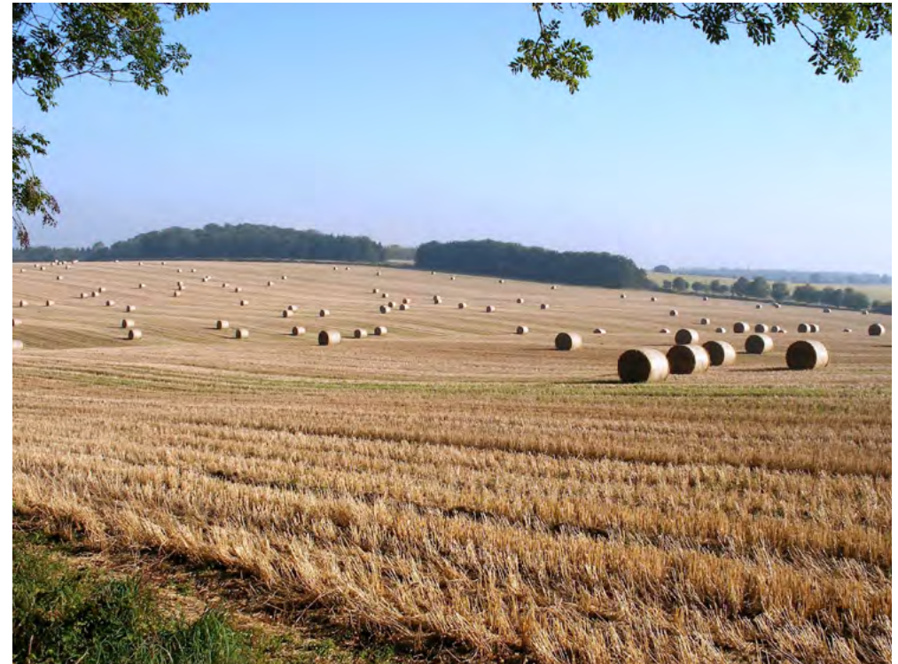
Most of the Downs is arable land, large open fields with thin hedges and a backdrop of woodland and shelter belts.

Continuing growth in population, housing and economic development in South Hampshire, Basingstoke and Andover affects the Downs in several ways, but also benefits from their proximity as a recreational outlet, with benefits for health and wellbeing. Direct effects are the increasing visual impact of towns and cities visible from the Downs, increased traffic, noise and lighting. More indirect effects are the pressures on water supply and quality through abstraction, pollution and sewage discharge.