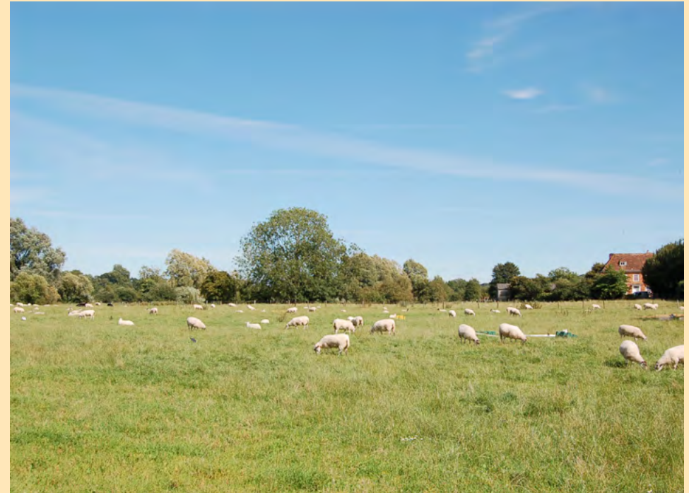
Grazing the river meadow pasture at Ovington.