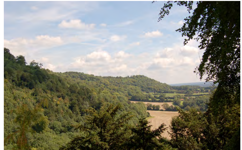
The Chalk and Greensand scarp of the East Hampshire Hangers, overlooking the Western Weald.

Major radial transport arteries cut through the Downs connecting London with Hampshire and the South West: the M3, A31, A303 and the main railway lines from London Waterloo to Salisbury, Southampton, Bournemouth and Poole, and Weymouth. The A34 cuts north-south through the centre of the NCA connecting Southampton docks with the Midlands. Traffic on these routes has a significant impact on the landscape.