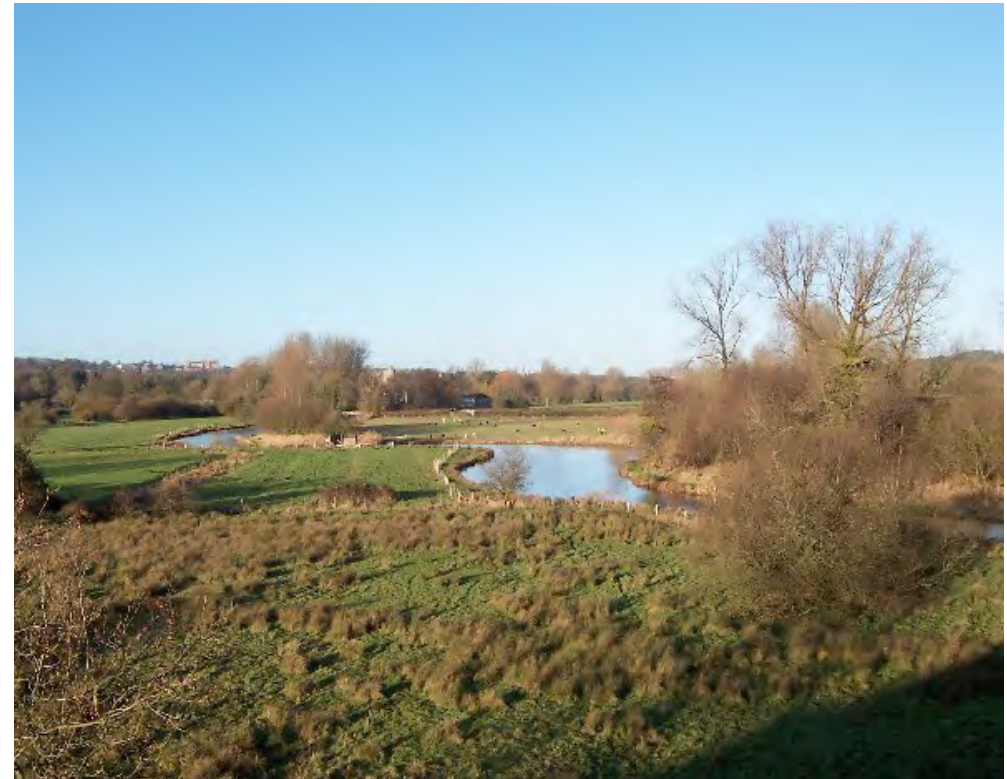
The River Itchen south of Winchester with fenced banks for fishing and typical water meadow habitats.